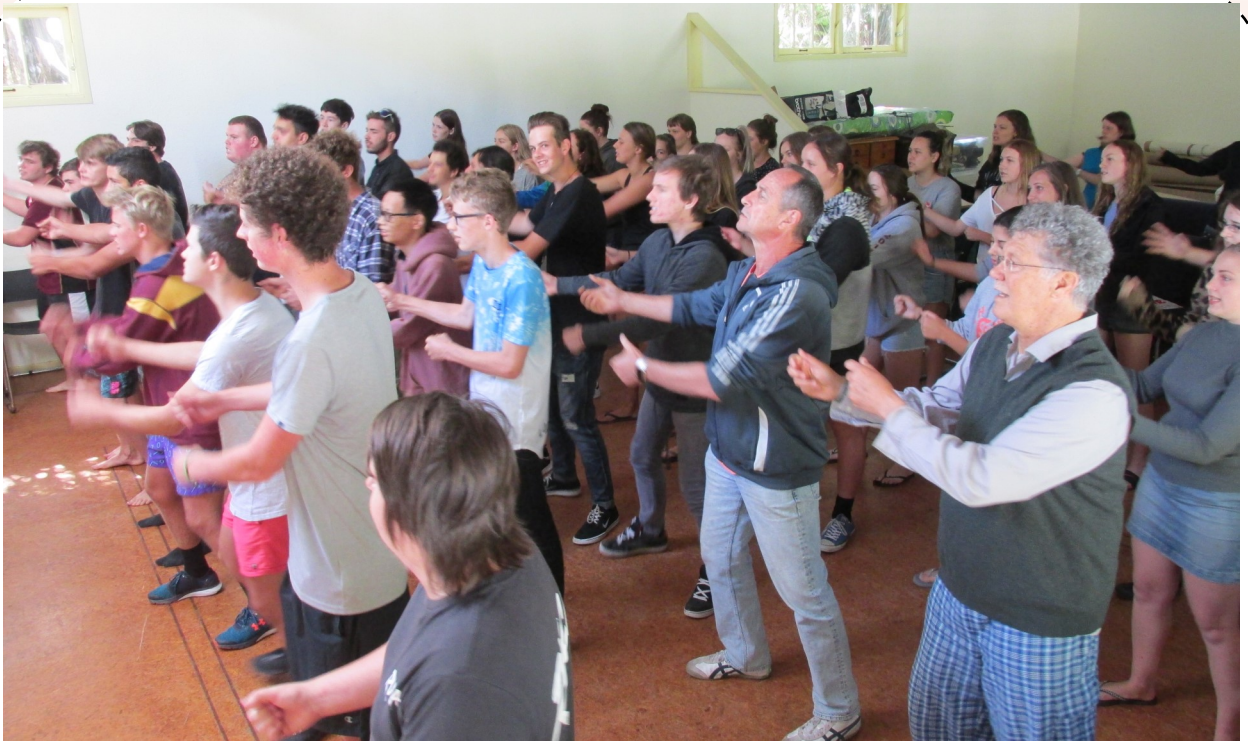
Top: Staff and Year 13 students at the camp the week prior to the start of school Below Left: Staff serving the haakari to parents and students after the powhiri in the hall Below Right: Parents mingling with their meals under the sun umbrellas