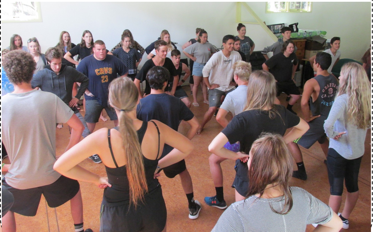
Below: The learning and practising in full swing