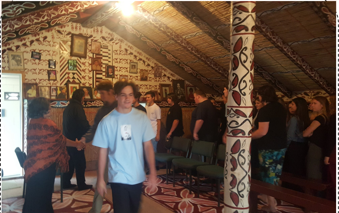
Top: Year 13 and staff were welcomed at Tumutumu Marae on the morning of their camp at Sapphire Springs, Katikati