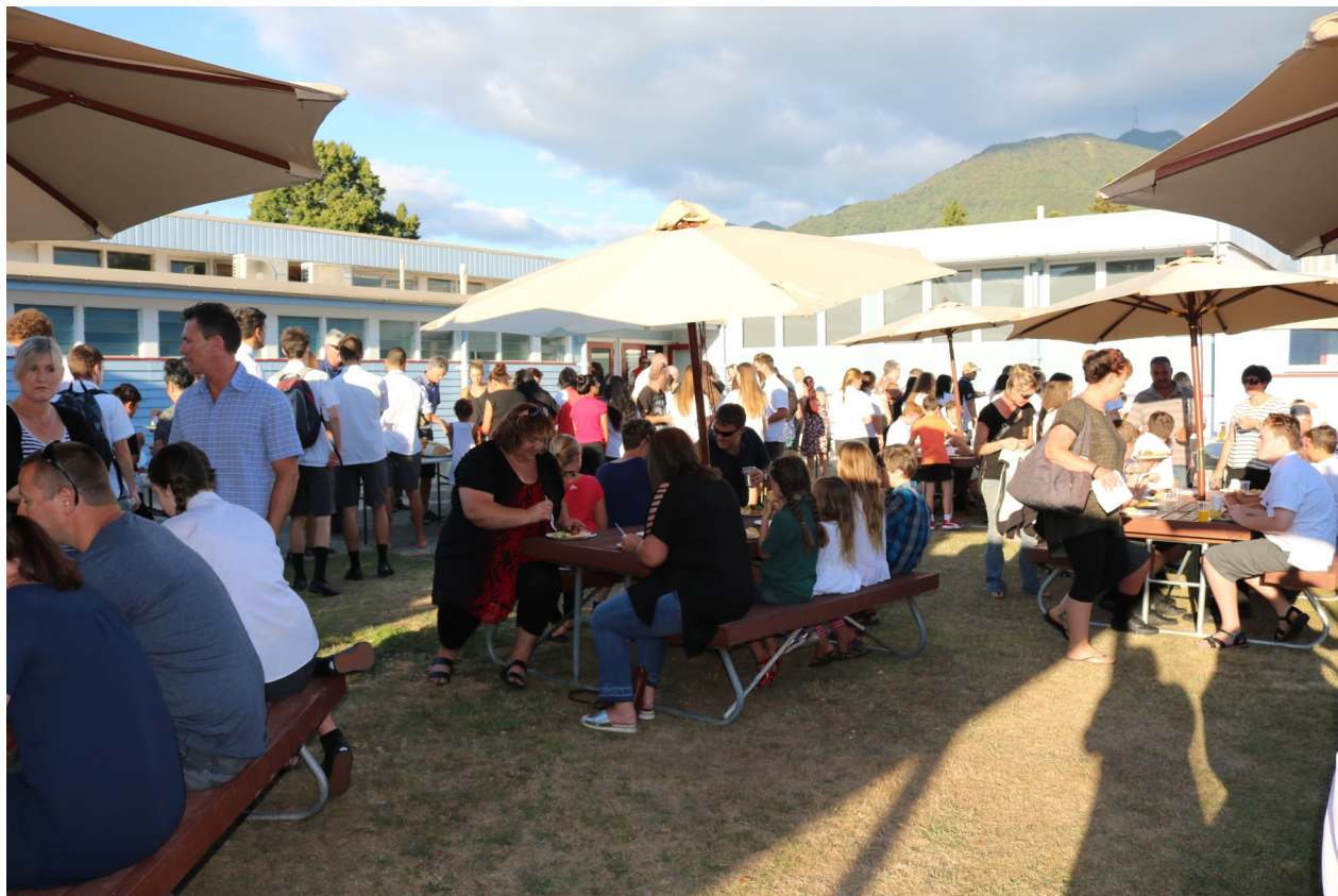
Top and Bottom: Parents, students and staff enjoying their barbecue under the sun umbrellas outside E Block