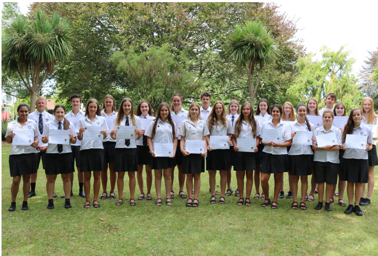
All Merit and Excellence recipients

We would also like to thank our staff for all the work they did in 2016 to support our student success.