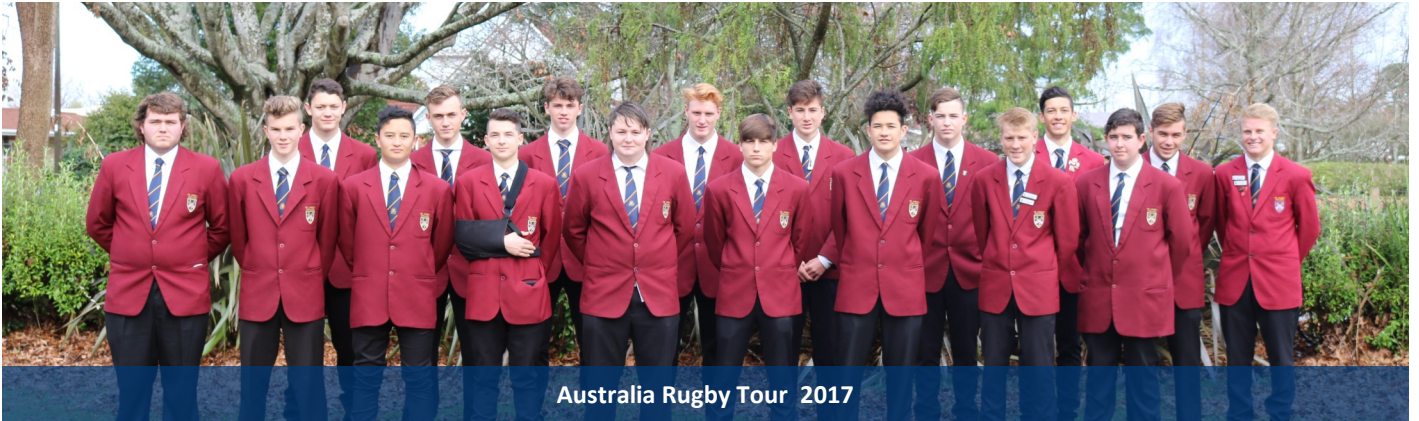
Australia Rugby Tour 2017