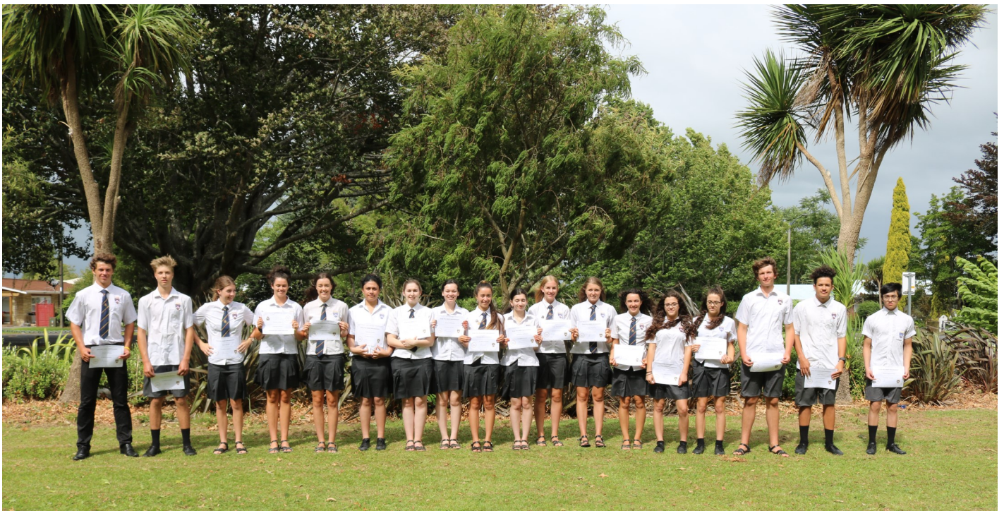
Merit and Excellence Endorsement Recipients

Gender comparison data interestingly shows our boys are lagging when it comes to achieving at excellence or merit level. The challenge is on boys! Time to show the girls that 'boys can do anything!' The results showed parity across all ethnicities which is outstanding. Big hats off to all the hard-working teachers and support staff who we often forget to thank – your efforts don't go unnoticed.